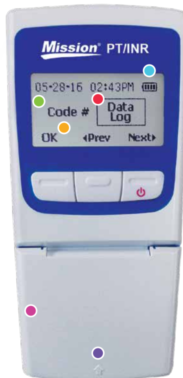
Mission ® PT/INR Monitoring System